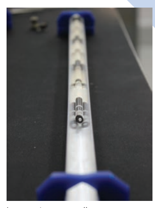
Lens system on a rail

*MHRA 'Managing Medical Devices - April 2016