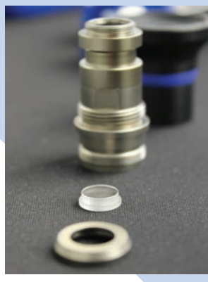
Eve piece broken down